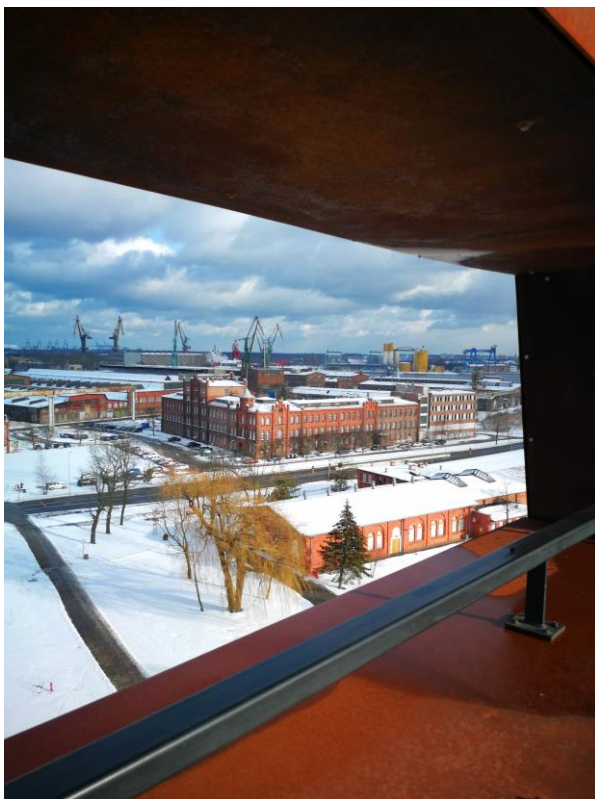
A view from the roof of the European Solidarity Center, Gdansk

You may combine this trip with Gdansk City Tour , World War 2 in Gdansk or The Solidarity Route in Gdansk – The Lech Walesa tour